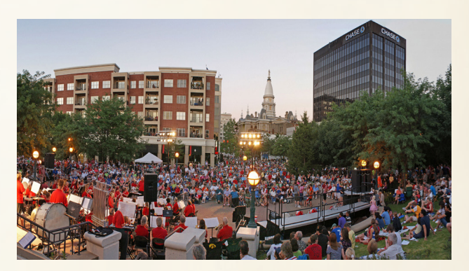
Reihle Plaza located across the street from Renaissance Place host dozens of events each year that attract thousands of participants